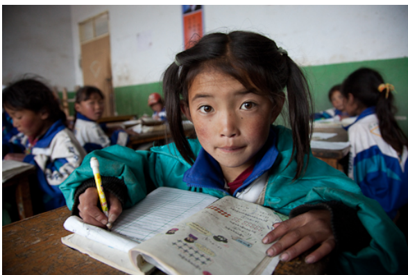
THO CHE CHEY ("Thank You")